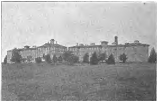
OSAWATOMIE STATE HOSPITAL.